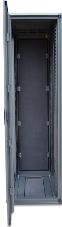
Image: Front View with Door Open Model AR-42U600 x1000-G - 42U