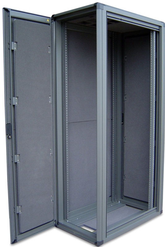
Image: Offset Rear of Rack with Side Panel Removed Model AR-42U600x1000-G - 42U

The AcoustiRACK™ acoustically treated enclosures are self-venting cabinets that have been designed to trap and absorb unwanted noise generated inside whilst allowing free air movement and heat exchange with the outside of the unit for cooling.