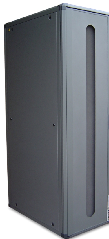
Image: Front Offset Side View Model AR-42U600x1000-G - 42U

Recent changes to directives & legislation show the general trend is one towards much lowered tolerance of workplace noise levels.